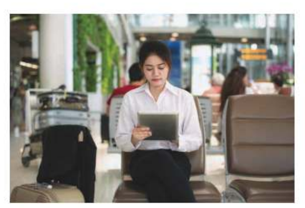
a business trip