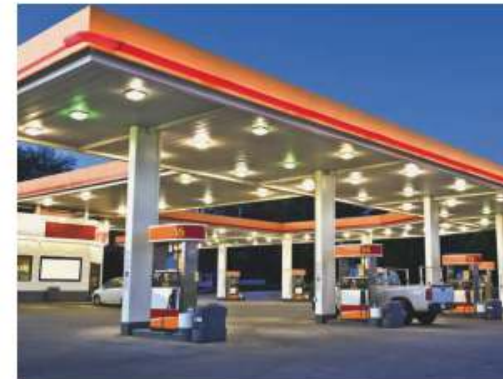
a gas station