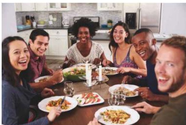
have a party